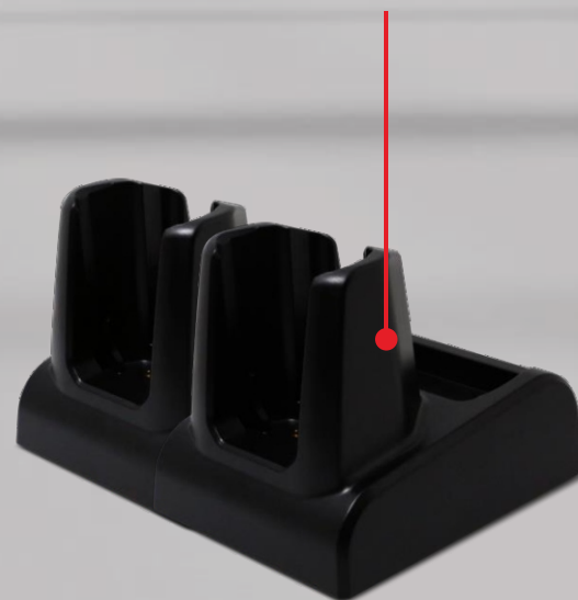
Dual Slot Cradle*