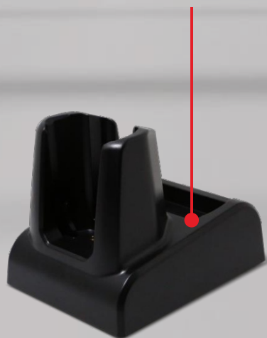
Single Slot Cradle