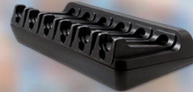
6 Slot Battery Charger