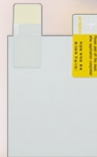
LCD Protection Film