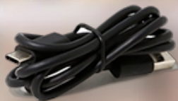
USB Type-C cable