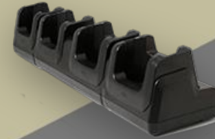
4 Slot Cradle