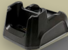
Single Slot Cradle (opt. Ethernet)