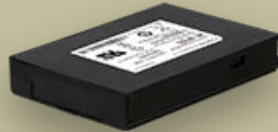
Extended Battery (5,800mAh)