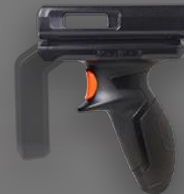
Gun Handle (opt. UHF RFID)

- Caution: This list is subject to change -