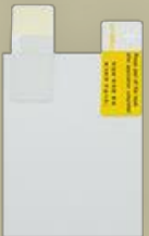
LCD Protection Film